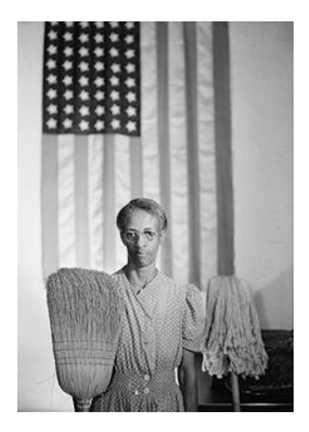
American Gothic, Washington, D.C., 1942

Parks devoted a great deal of his photographic artistry to social justice causes, during his FSA period, and after. Here are two of his best-know images. Breaking with my custom of discussing and interpreting the images, I think I am going to say nothing at all about them, except to ask you to look, think, and feel.